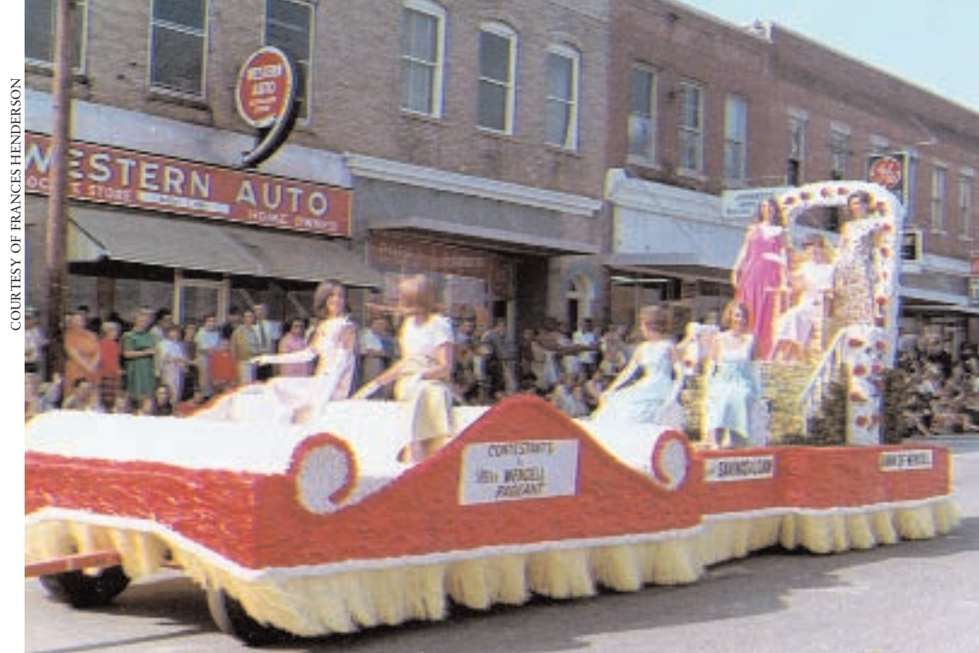
During the 1960s, the annual event expanded to include a variety of competitions and a parade, complete with a float for the winners of the Miss Wendell pageant that was sponsored by the Wendell Jaycee's.

What began as a way of celebrating the importance of tobacco and farming to Wendell's heritage and the local economy, gradually evolved over the years into a celebration of culture and life.